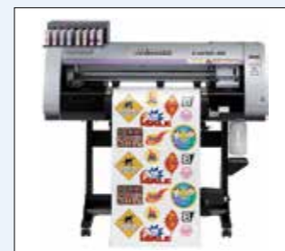
Simple Studio / FineCut 8 is supplied with the CJV30 Series as standard.

Designing and creating cutting data can be done in either CorelDRAW or Illustrator.